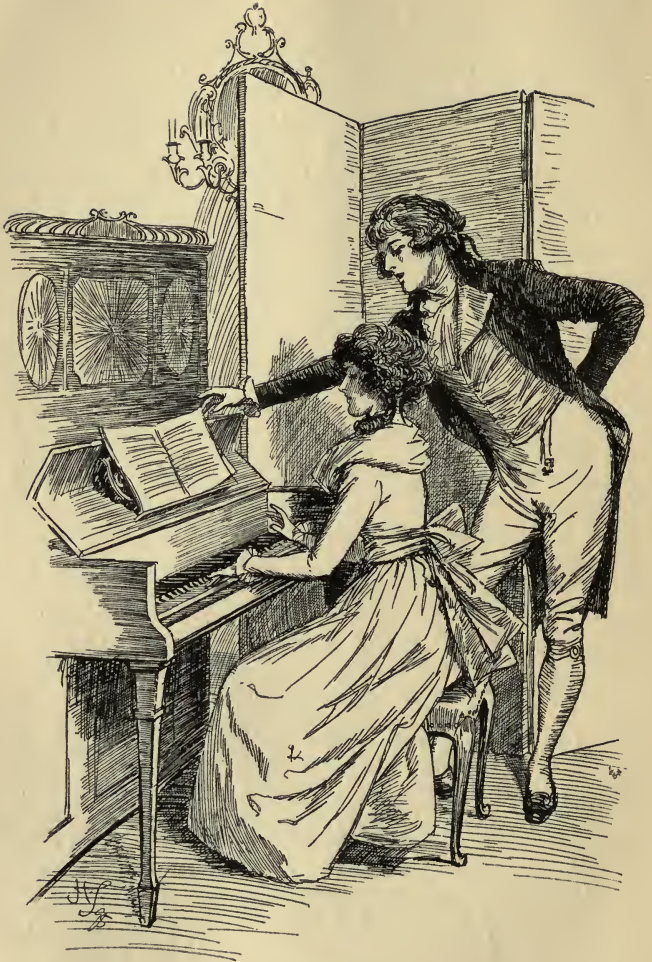
They sang together.